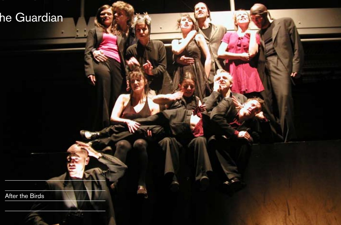
After the Birds