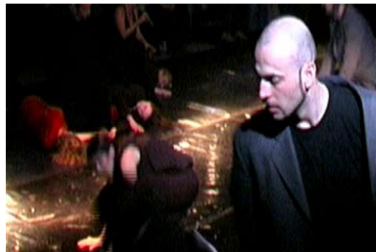
After the Birds